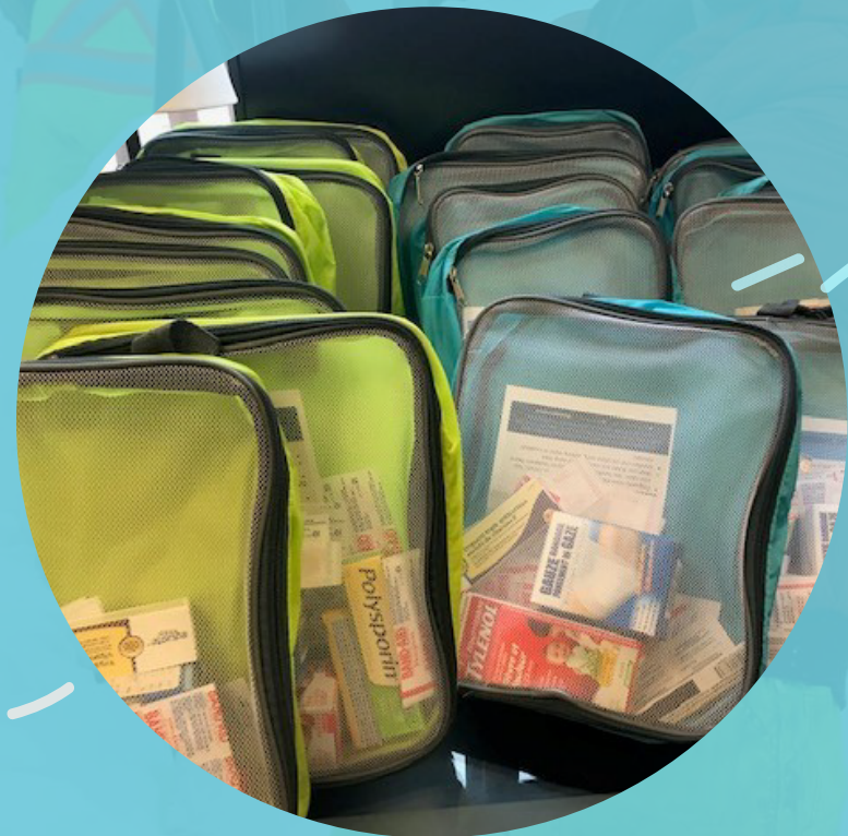
CFY team members assembled pandemic self-care kits which were delivered to youth and young families alongside meals and supplies to help them stay well at home. This project was made possible thanks to support from the Rotary Club of Northeast Avalon.

The pandemic has created many organizational challenges, and many of the youth and young families we serve have been greatly impacted. While we have taken care to ensure that our programs and services have expanded appropriately, we have also been working hard to inform the broader community response and to ensure government policies are mindful of marginalized communities.